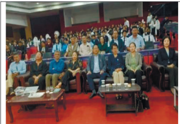
9 th October 2023: Sensitization Workshop on Management of MLPs and SUPs at Kohima, Similar programme was conducted at Mokokchung on 11 th October 2023 and at Dimapur on 13 th October 2023