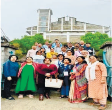
24 th – 27 th July 2023: A regional workshop on 'A Study of School Assessments & Examination Practices & Equivalence of Boards' organised by PARAKH, a constituent unit of NCERT, New Delhi, in collaboration with NBSE at Kohima