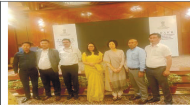
22 nd May 2023: Workshop for Review cum discussion on School Assessments and Examination practices followed by various Boards conducted by Department of School Education & Literacy Ministry of Education Government of India at New Delhi