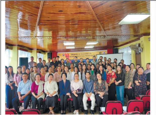
12 th September 2023: Training of teachers on Adolescence Education Programme (AEP) in Kohima