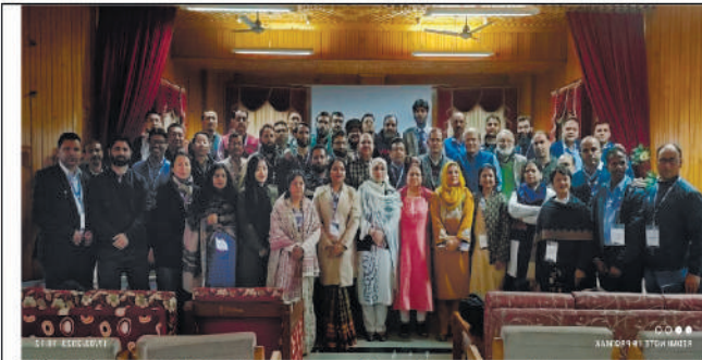
15 th -17 th March 2023: Workshop on 'Transformation of Assessment Practices at Secondary Stage', held at Srinagar, Jammu & Kashmir, conducted by NCERT