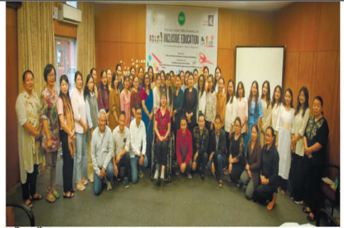
14 th -15 th September 2023: Two Days Short Training on Inclusive Education at Conference Hall, Hotel Japfü, Kohima