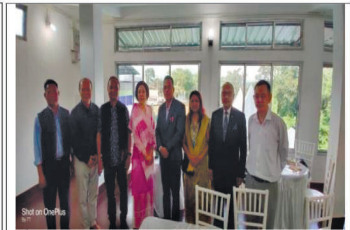
19 th October 2023: Meghalaya Board of School Education (MBOSE) Golden Jubilee at Tura