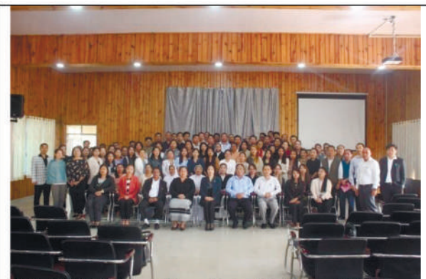
28 th April 2023: Meeting with new Heads of Institution at NBCC Platinum Hall, Kohima