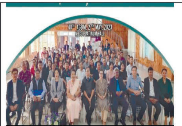
27 th May 2023: All Nagaland Private School's Association, 40 th AGBM General Body Meeting held at NBCC Platinum Hall, Kohima