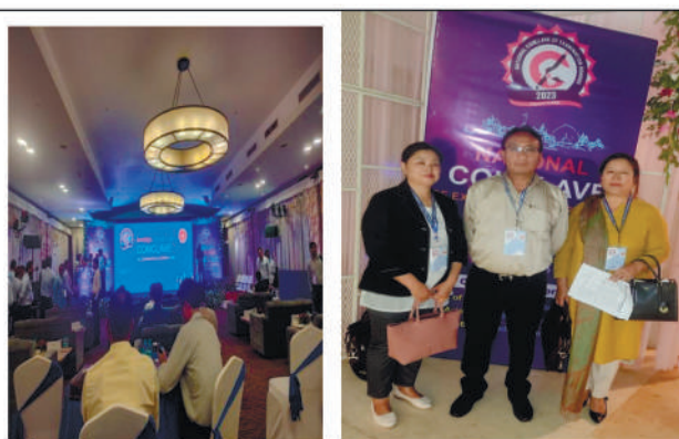
16 th - 17 th June 2023: Two Day 'National Conclave of Examination Boards, 2023' regarding Reforms Roadmap Development and Sharing of Best Practices organised by BSEB, under the aegis of CBSE, held at Patna, Bihar