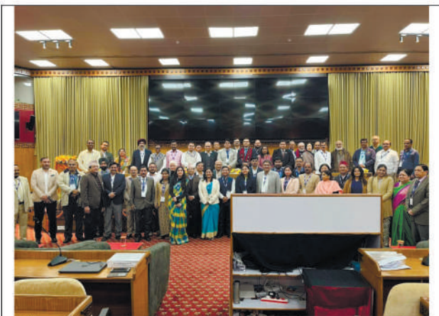
23 rd – 25 th November 2023: 52 nd Annual Conference of COBSE on the theme "Implementation of NEP 2020: Role of School Education Boards" at Gangtok, Sikkim