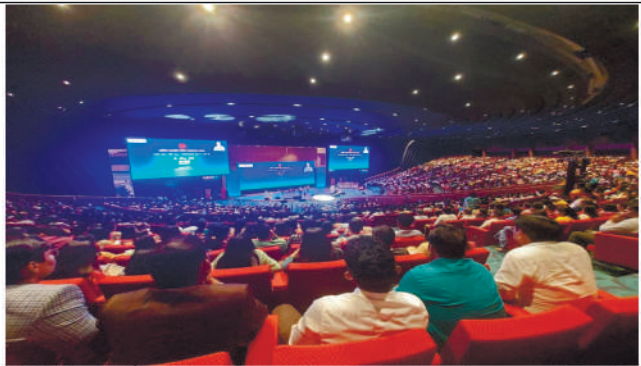
29 th – 30 th July 2023: Event to commemorate the 3 rd Anniversary of NEP 2020 and 2 nd edition of Akhil Bharatiya Shiksha Samagam held at India Trade Promotion Organisation (ITPO) Pragati Maidan, New Delhi organised by Department of School Education & Literacy, Government of India.