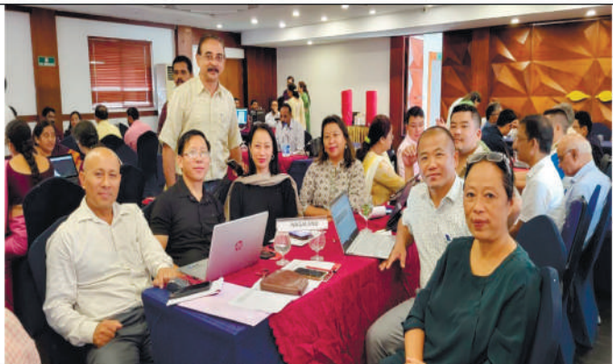
21 st -22 nd August 2023: Two Days Capacity Building Workshop on 'Use of Competency Based Learning Teaching Practices in Large Scale Assessment', at Port Blair, Andaman & Nicobar Islands.